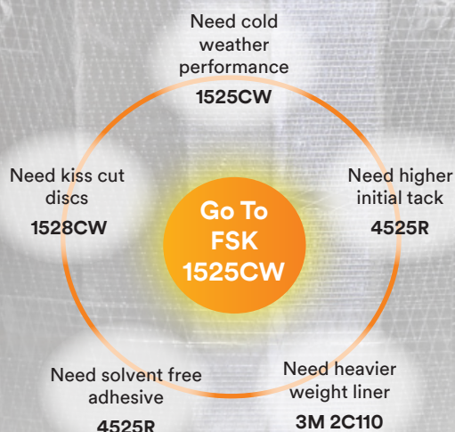
% Ultimate Bond Range

*1528CW is a 2.5" disc version of 1525CW.